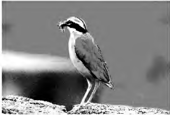
Indian Pitta Pitta brachyura

This was the first bird I saw on revisiting Hingolgadh years after my last trip as a student; they arrive in the beginning of monsoons, proclaiming its advent unmistakably with loud metallic calls.